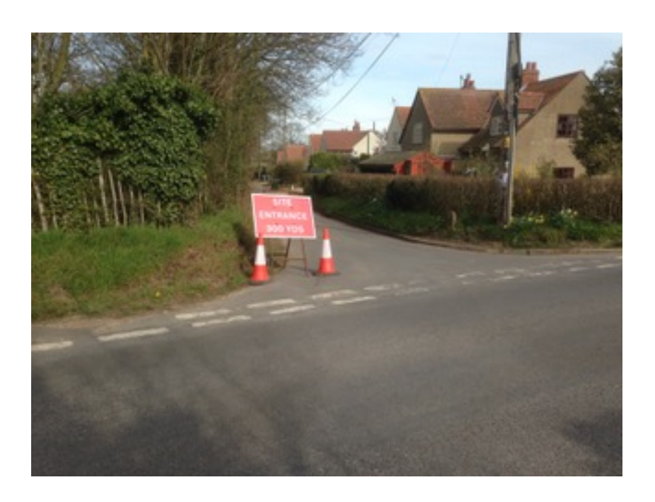
Image (SPR 1) above shows the entrance to Church Road off the Aldeburgh-Saxmundham Road. The road is single track and is a pedestrian route to footpaths, the allotments and Church and Village Hall. The spiritual and social hub of the village. A more appropriate sign would be – 'Site traffic beware of pedestrians'. The siting of the sign was actually dangerous bearing in mind the narrowness of the lane and sightlines are difficult exiting the road.